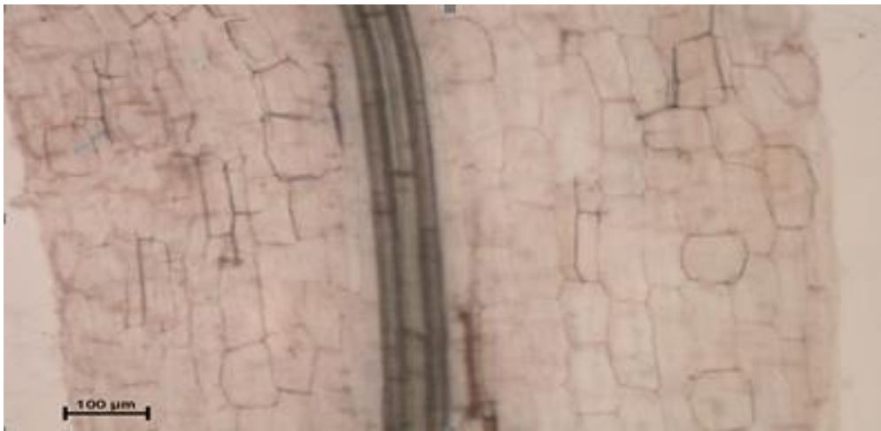
Figure 2. Micrograph of non-inoculated basil seedlings roots (-AMF).